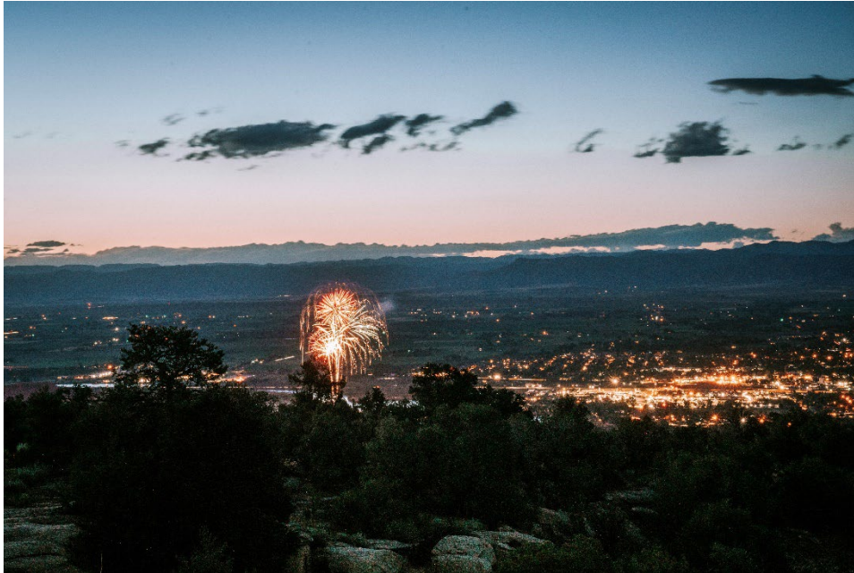
View of the Fruita 3 rd of July Fireworks Show from the Colorado National Monument.

Management Fire Management Team, and Mesa County, for providing firefighting support for the event. The show was fire free and there was a great turnout from residents.