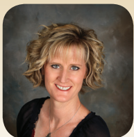
MAYOR LORI BUCK 858-7767

Fruita City Council If calling City Hall at 858-3663 does not answer your questions, please feel free to contact any of your City Council Members.